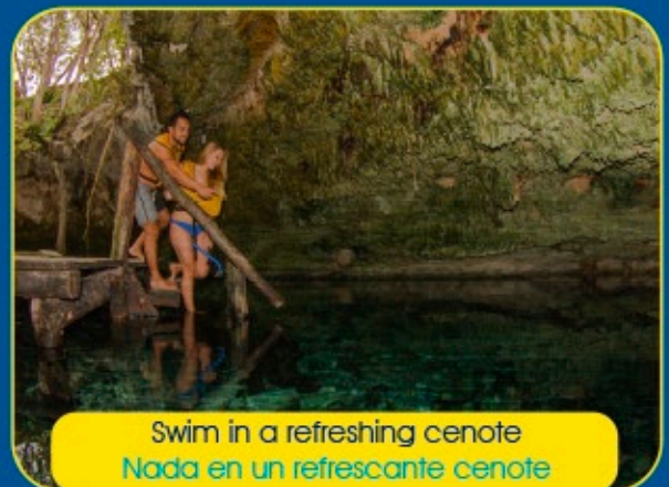
Swim in a refreshing cenote Nada en un refrescante cenote