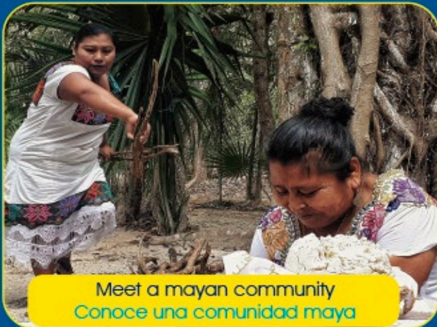
Meet a mayan community Conoce una comunidad maya